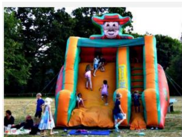
Almost time for Horningsea Village Day!

The evening's entertainment will start at 6.30pm with music and dancing to a band and the evening will end with a disco for all of those Dancing Queens still standing until they can't stand anymore.